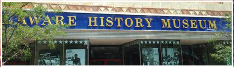
Delaware History Museum