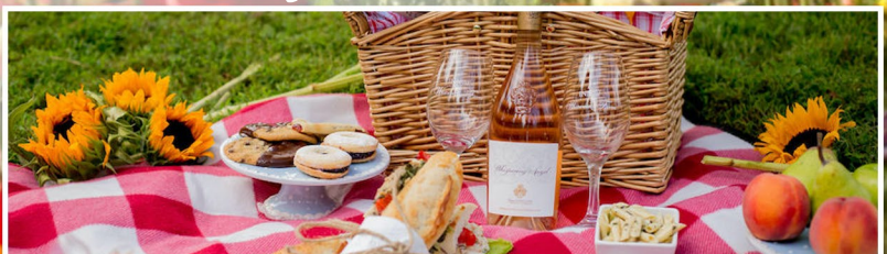
Picnic at the Brandywine

Limited seating. First come, first served. Please reserve your place with Bev at the front desk.