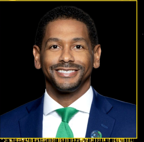
Chief Executive Officer The WRK Group