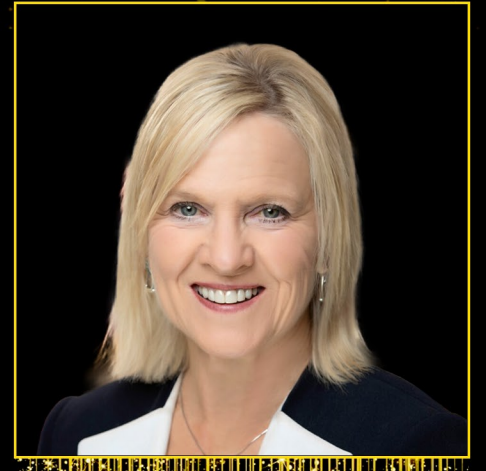
Former Lt. Gov. of Delaware