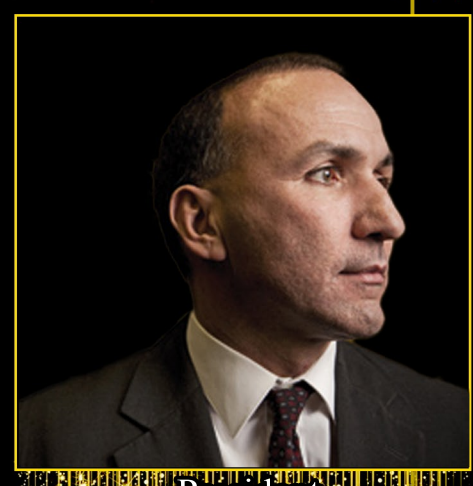
President President Emergency Response Protocol